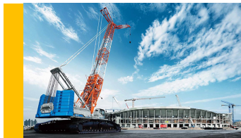
With a lattice boom