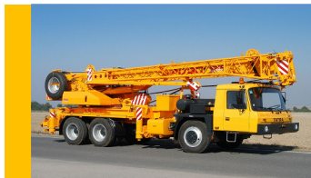
With a lattice boom