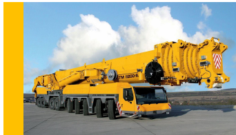
With telescopic boom