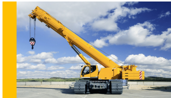
With telescopic boom